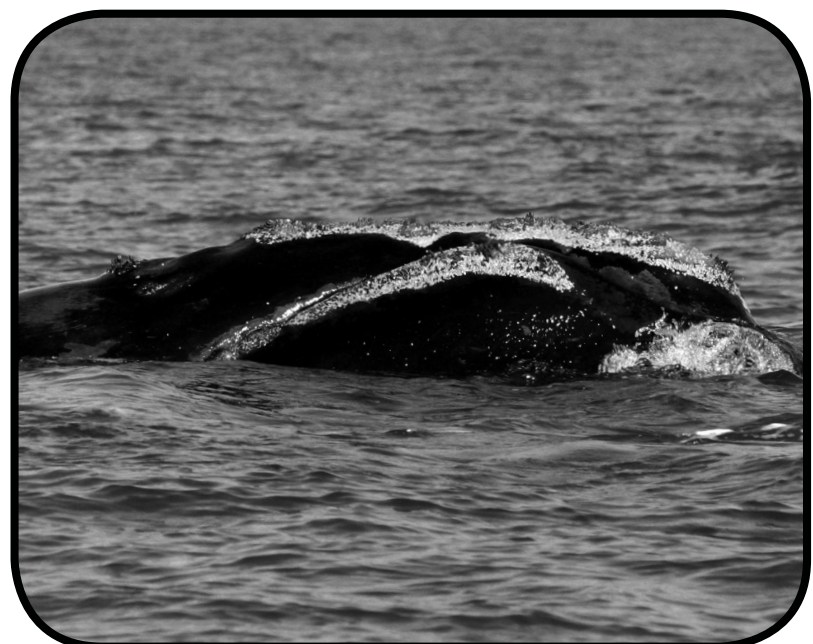
White Markings On Head

Report right whale sightings and any whales in distress to NOAA Fisheries Greater Atlantic Marine Animal Reporting Hotline 866-755-6622 or to the Coast Guard on Channel 16.