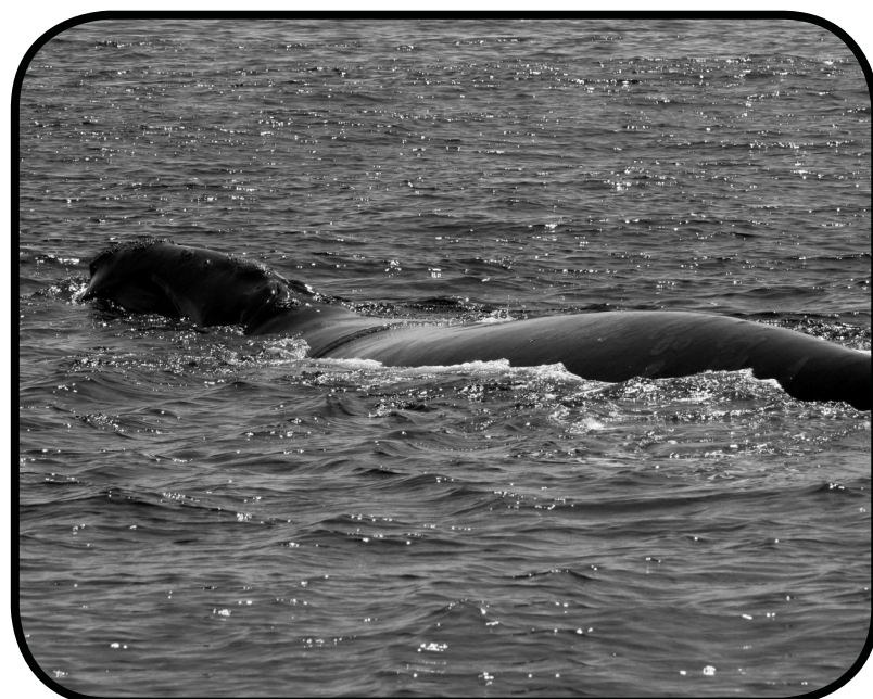
No Dorsal Fin