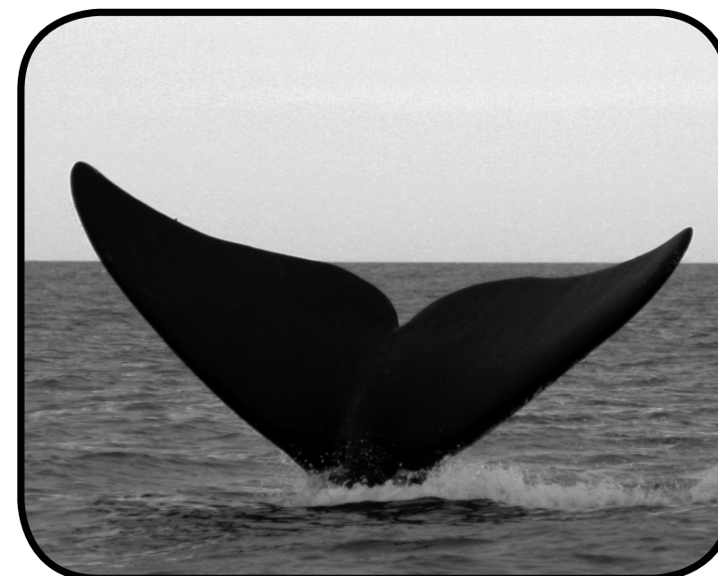
All Black, Smooth Tail