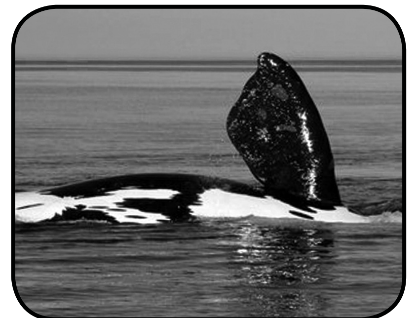
Paddle Shaped Flippers

REPORT RIGHT WHALE SIGHTINGS: 866-755-NOAA (6622)